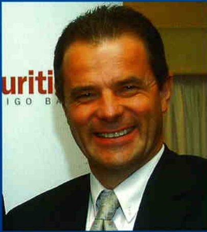
Chair: Noel Coxall